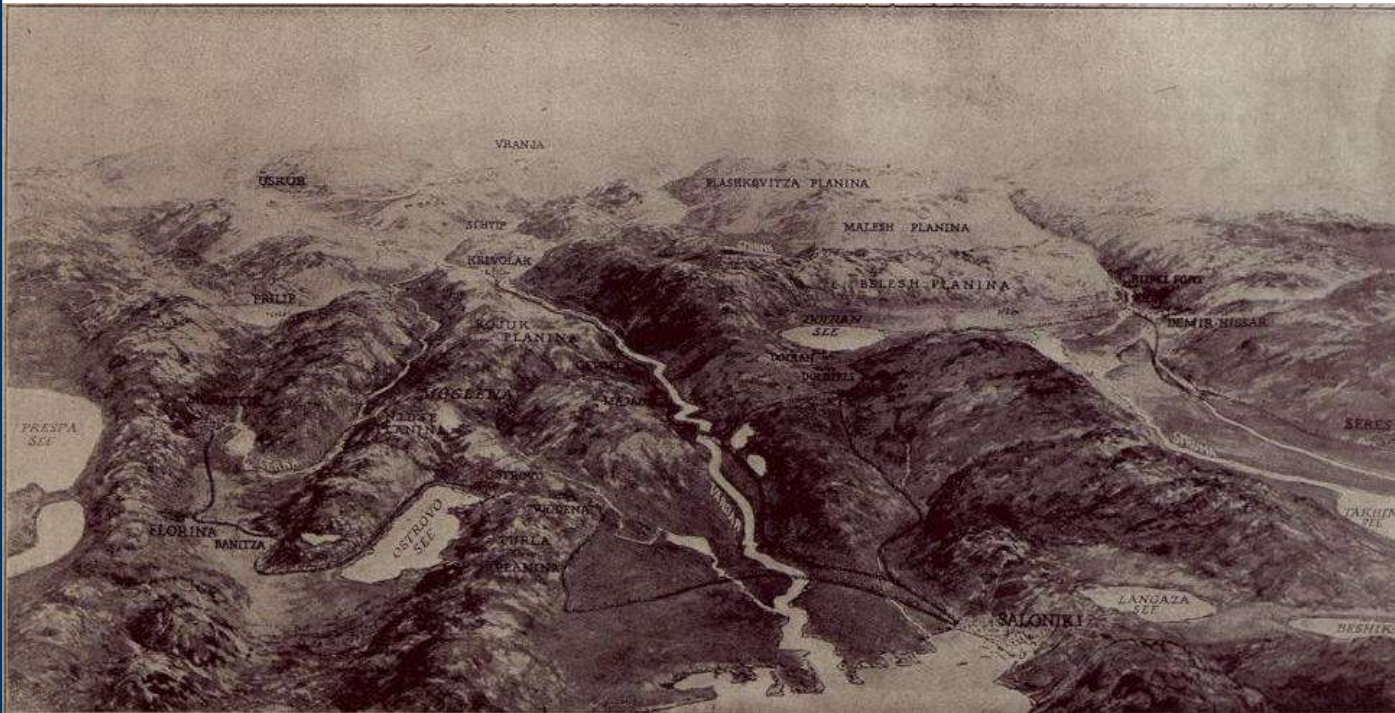
*Balkan Front German Relief Map