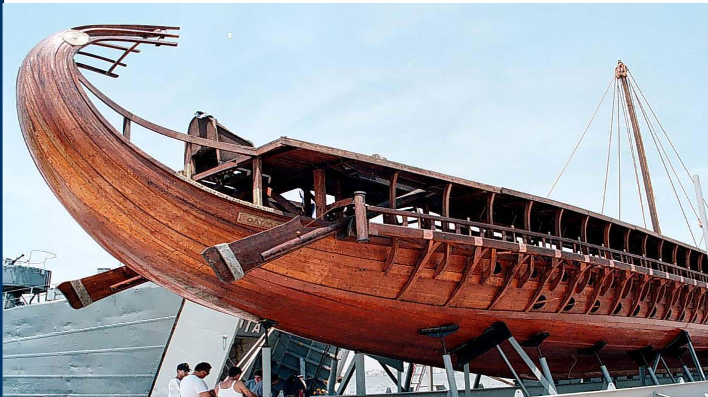
*Trireme Olympias, Park of Maritime Tradition