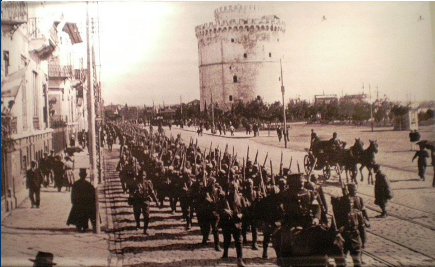
*Entente Troops parading in Thessaloniki