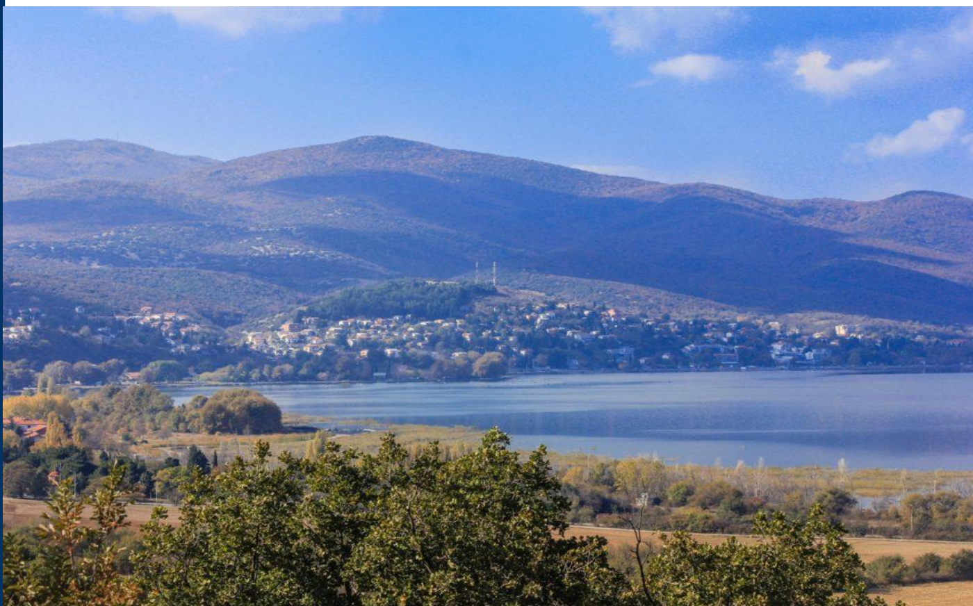
*Doiran Lake and Village